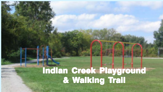
Indian Creek Playground & Walking Trail

We have accomplished much this past season including upgrading benches at Parmelee Park and renovating the skate park structure; establishing a way station for Monarch butterflies at Ansted Park ; and enlarging the west parking area at White Park . We also just completed the Bedford Township Parks and Recreation Master Plan .