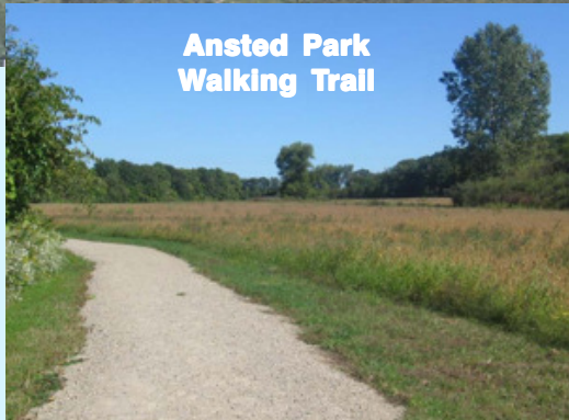
Ansted Park Walking Trail